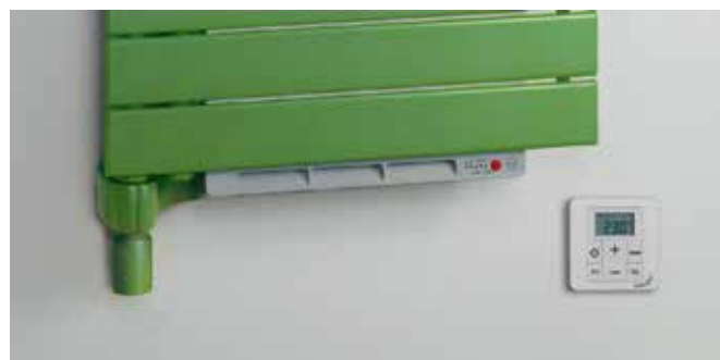
Radiator colour: Reseda Green