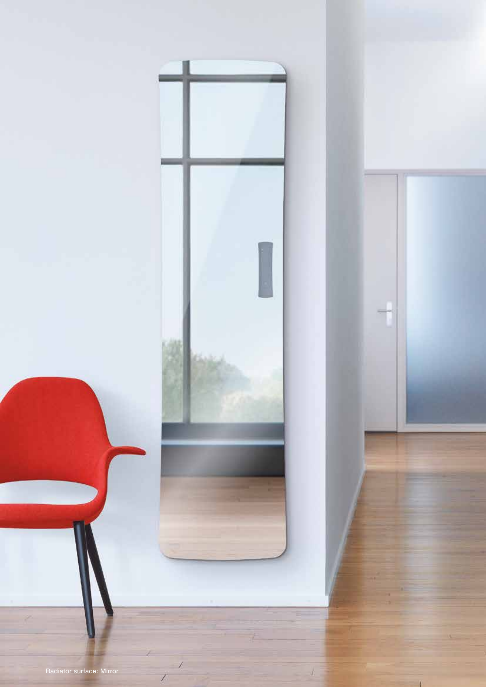
Radiator surface: Mirror