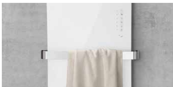
Radiator surface: White gloss