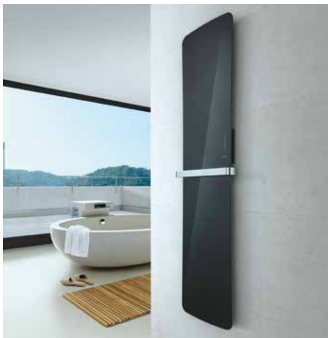
Radiator surface: Black gloss