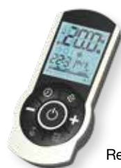
Remote control model 4